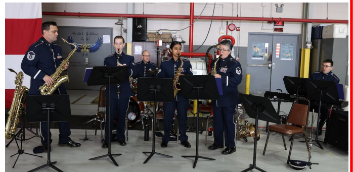
Entertainment provided by the 136th Texas Air National Guard! What a treat! Played some great 40s tunes!